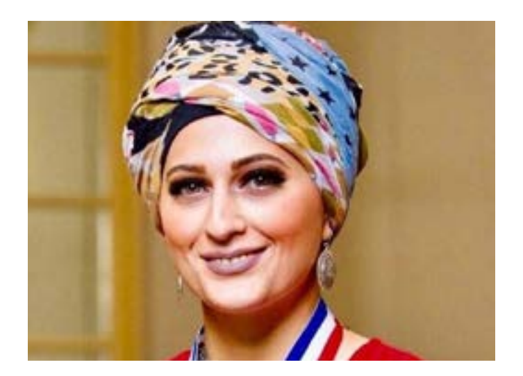
Now, I am not an advocate who goes to DC to share my story and to be the voice for the voiceless. Now, I'm an organizer who is going with others to advocate so there is no more voiceless; we all have a voice together and advocate together."